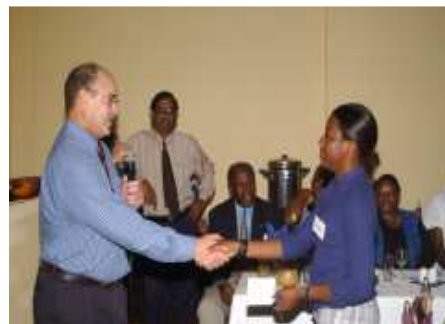
Recipient of special prize for UNITRA MBBCh undergrad category